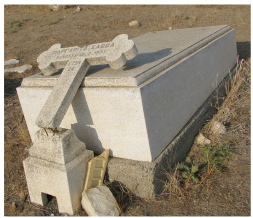
Figure 6: Margarita Savva