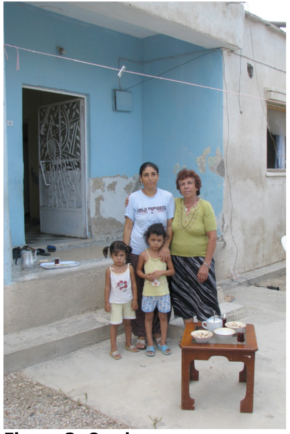
Figure 3: Our home