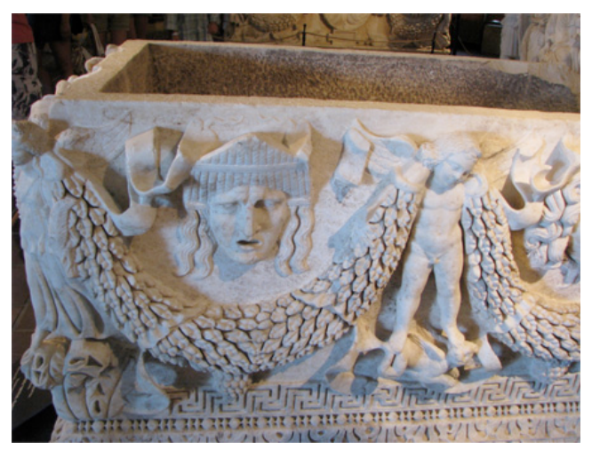
Figure 4: Medusa