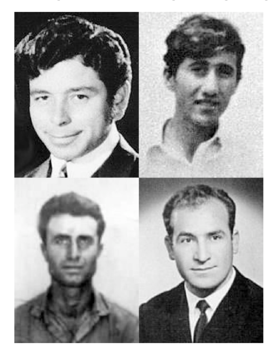
Figure 8: "Undeclared Prisoners and Missing Persons in Aphania"

Many of the sacred places remind one of those violences of those actors who carried out the policies in an imperial-sovereign intrasettler conflict. Yet, these conflicts, the symptoms of accumulation and genocide cannot be merely resolved by mere legal and other kinds of national and class struggles. This conflict spills over and becomes intertwined in that InTensions Journal