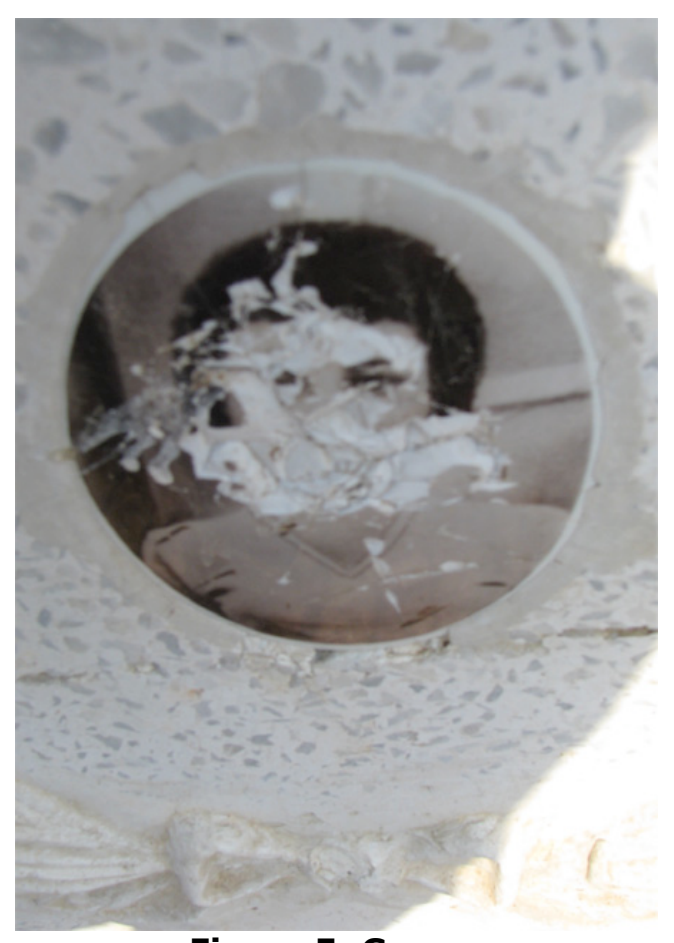
Figure 5: Graves