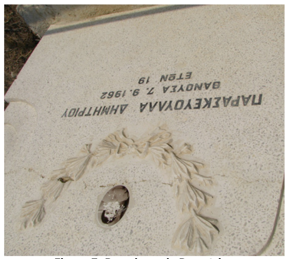
Figure 7: Paraskevoula Demetriou

InTensions Journal Copyright © 2009 by York University (Toronto, Canada) Issue 3 (Fall 2009) ISSN# 1913-5874