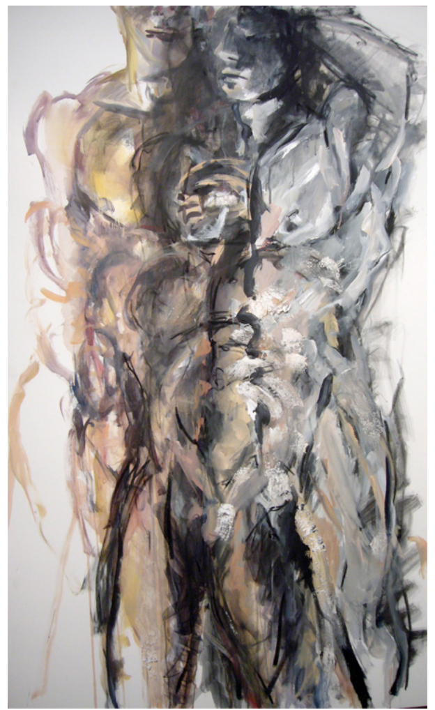
Figure 9: "We are here" Original art by Nicholas Panayi

<sup>i</sup> These photos are all taken from the Missing Cypriots Page , supported by the Pancyprian Organization of Parents and Relatives of Undeclared Prisoners and Missing Persons. http://www.missing-cy.org/home.html