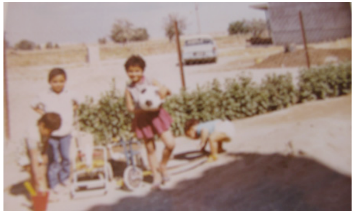
Figure 1: Our homes

the creation of buffers: ethno-national conflicts. The village next door kicked out much of its population, those Turkish Cypriots who were deemed contaminants to a purist ethno-nationalist project of Greekness.